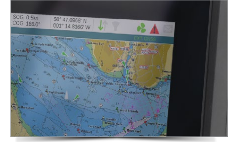
Full color display with day and night modes. Integrated CMAP compliant chart engine.